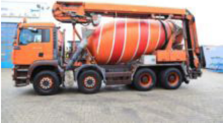
The conveyor in it's folded position on the truck/mixer

It was two and half years before my MD released the funds for me to purchase the demonstrator with which I hoped to increase my customer base.