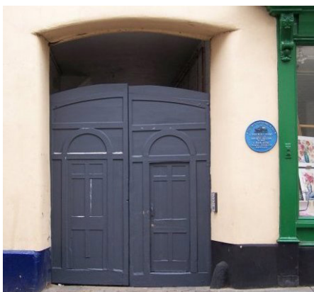
Entrance to 'Swan and Falcon'