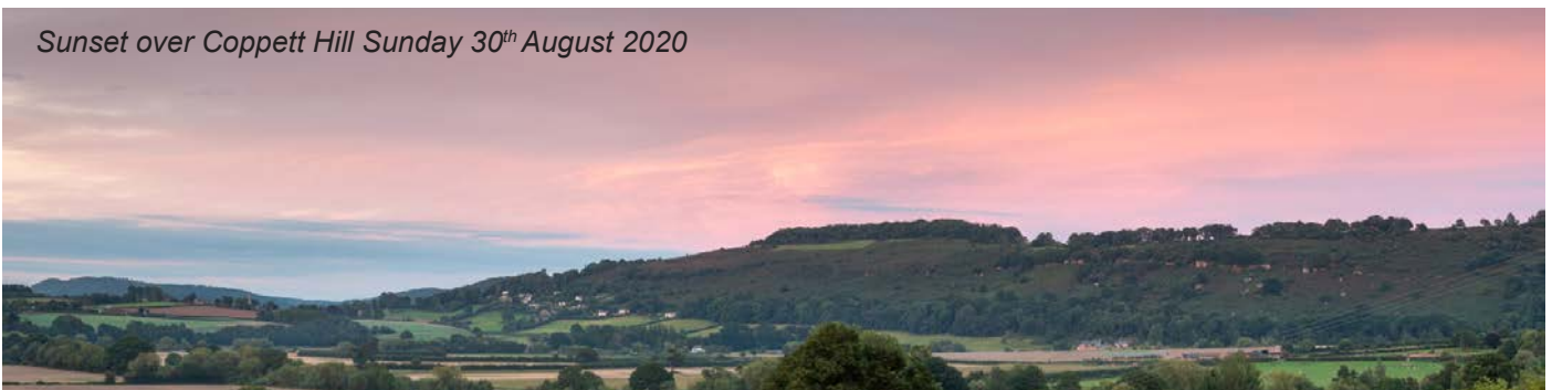
Sunset over Coppett Hill Sunday 30 th August 2020

The foregoing details are very much a precis of fuller information held on file which can readily be passed electronically to any member who is interested.