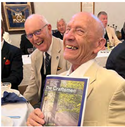
The Craftsmen Newsletter