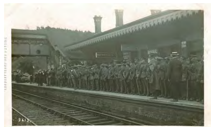
The European War. Mobilization & departure of the Territorials from Ledbury. Aug. 5th, 1914-

The station was closed as a manned station in the 1960s and the buildings demolished sometime later.