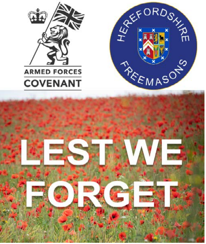
The Craftsmen Newsletter

As the stars that shall be bright when we are dust, Moving in marches upon the heavenly plain; As the stars that are starry in the time of our darkness, To the end, to the end, they remain.