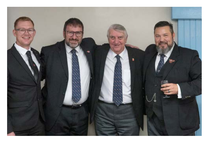
United in raising funds for charities and good causes