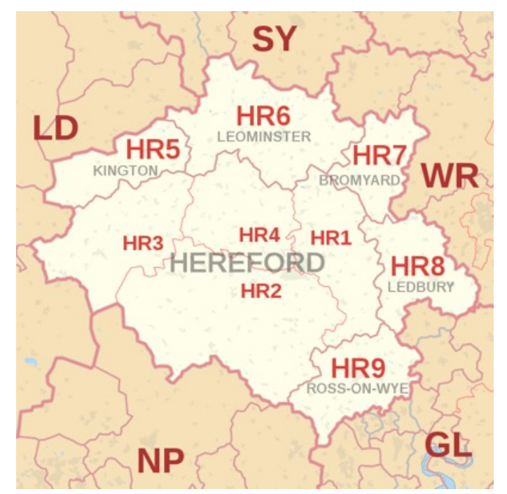
The Province and surrounding areas are divided up by postcode.

Another set of unsung heroes who do sterling work for members of the Province by providing support during very difficult times.